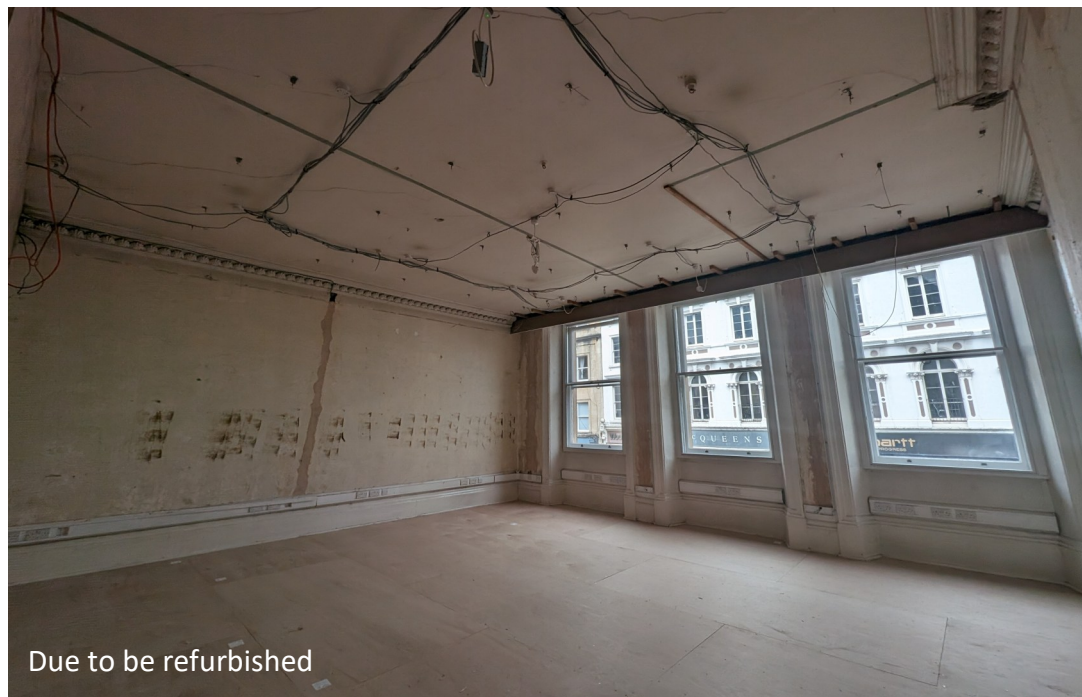
Due to be refurbished

Interested parties are advised to make their own enquiries direct with the Valuation Office Agency ( www.voa.gov.uk ).