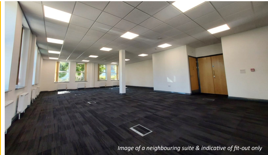
Image of a neighbouring suite & indicative of fit-out only

Whilst every care is taken in the preparation of these particulars, their accuracy cannot be guaranteed and no reliance should be placed on any statements or representation.